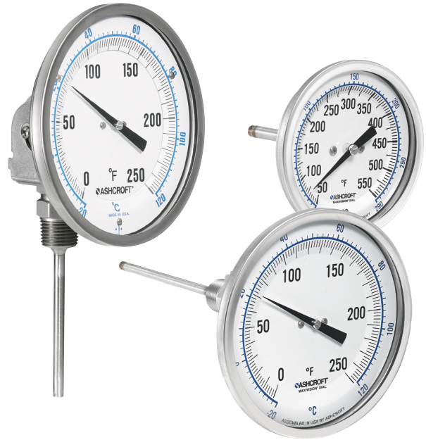
EL Bimetal 3", 5" dial sizes